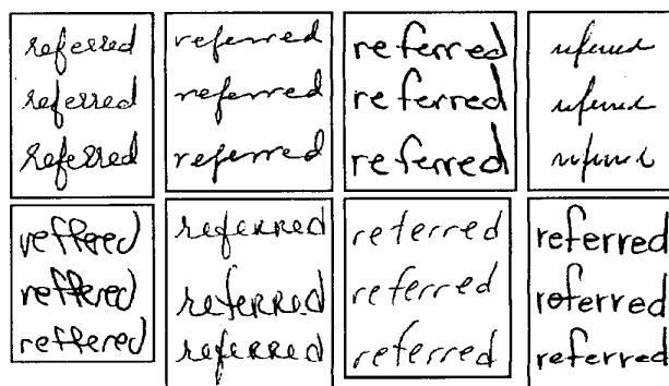
Figure 1. Variability in handwriting: Samples provided by eight writers (boxed), each of whom wrote the same word thrice.

There are two variabilities of concern while comparing handwriting: the variability of the handwriting of the same individual and the variability of the handwriting from one individual to another. These two variabilities are seen when several individuals are asked to write the same word many times (Fig. 1). Intuitively, the within-writer variation (the variation within a person's handwriting samples) is less than the between-writer variation (the variation between the handwriting samples of two different people). The goal of this study was to establish this intuitive observation in an objective manner.