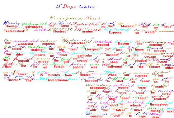
(b) Unknown document