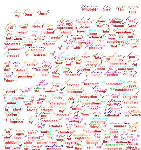
(a) Known document

Some of the processed documents used are shown in Figure 2.