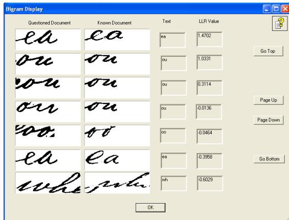
Figure 3. Comparison of “ea,” “ou,” “oo,” and “wh” between H. Melville’s writing and the Unknown document

We treated the problem as a case of four known (letters) and two unknown (verso and recto) documents and generated an LLR comparison value for each of the pairs of documents. Comparisons of some select bigram features are shown in Figure 3.